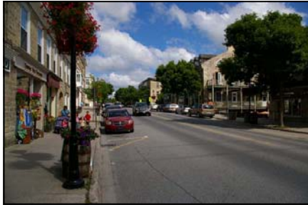
SUCCESS STOREY—MAIN STREET PERTH, ON

The Ontario Downtown Revitalization Program is a unique economic development tool modeled on the ground breaking Main Street Four-Point Approach developed through the National Trust for Historic Preservation in the U.S. “The Main Street Approach differs from typical community and economic development endeavours because it uses ‘heritage’ (in its broadest sense) as a tool for economic development” (p. iii) (see Main Street: Past and Present , Heritage Canada Foundation, March 2009).